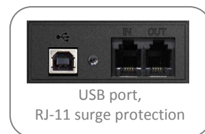
USB port, RJ-11 surge protection